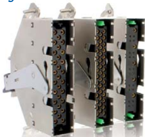
MSG 3U Series