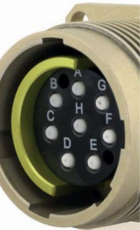
838 Elio 8 Elio Contacts HL3/R22 & HL3/R23 - EN45545-2 for multimode fiber Easy to clean IP66/ IP67