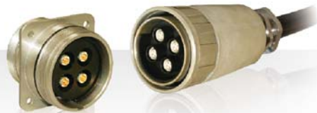
838 QUADRAX 2 to 4 Quadrax HL2/R22 & HL3/R23 - EN45545-2 NFFPA 130 compliant IP66/IP67 500h salt spray resistant Ethernet Cat.6