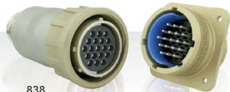
838 7 to 61 contacts 220V to 500V – 15 to 180 A HL2/R22 & HL3/R23 - EN45545-2 NFFPA130 Compliant IP66/IP67