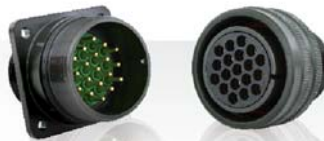
FER1 10/19/37 contacts #16 220V – 15 A HL3/R22 & HL3/R23 - EN45545-2 NFFPA 130 compliant IP66/IP67 – Quadrax Ethernet Cat.6