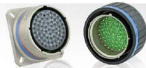
38999 High contact density Many layouts – 110V HL3/R22 & HL3/R23 - EN45545-2 IP67 – 5 shell materials